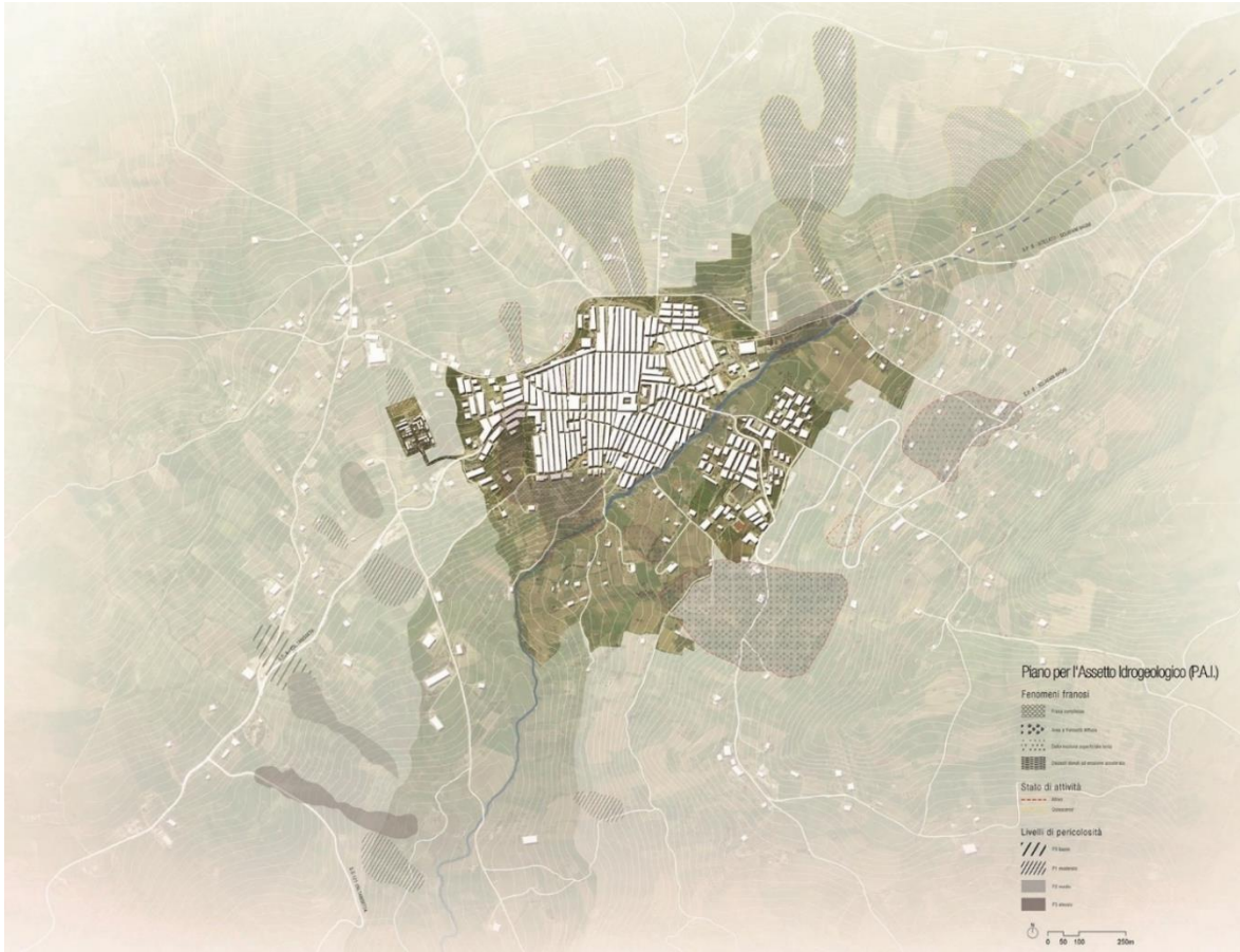
Fig. 4 | Redrawing the layout of Valledolmo in the Fiumara Valley territory