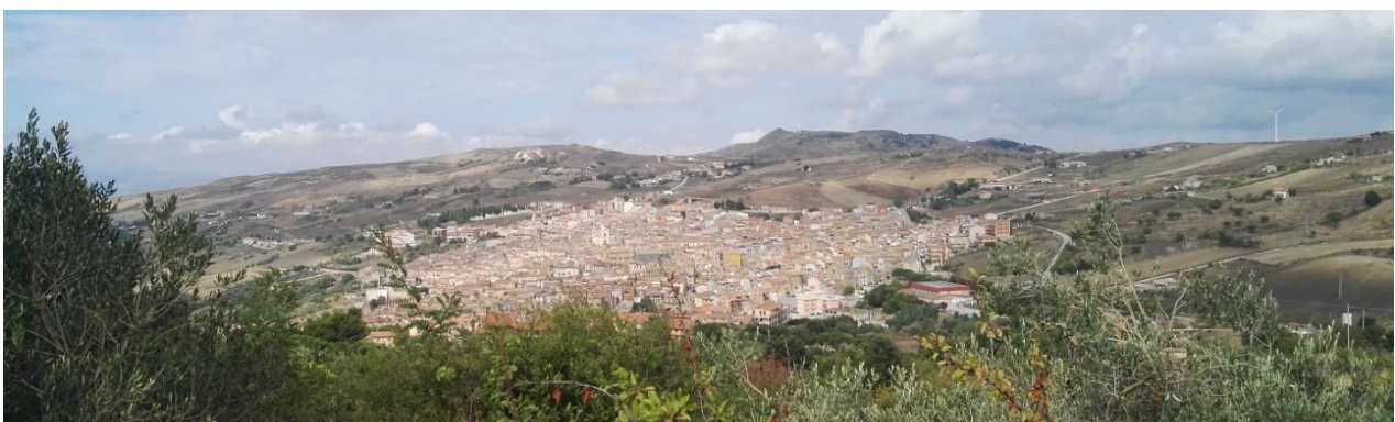
Fig. 3 | View of Valledolmo © LabCity Architecture (DARCH-UNIPA), 2021

The priority objective of the programme is to address to social, spatial and energy mixité , the redevelopment of the Roccafianara district, with the reconfiguration of the existing blocks, many of them now in a state of disrepair, and with the redesigning of public space for pedestrian use.