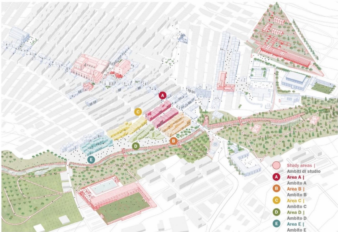
Fig. 5 | Redesign of the project areas of the Social Housing Community in the Roccafanara district in Valledolmo and the Parco della Salute in the Fiumara Valley © LabCity Architecture (DARCH-UNIPA), 2021